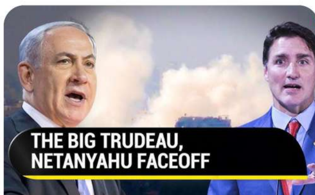
We're Coming...!: Biden's Big Declaration On Hostages Held By Hamas In Gaza