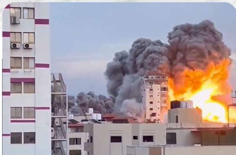
Israeli strikes hit near several hospitals as the military pushes deeper into Gaza City