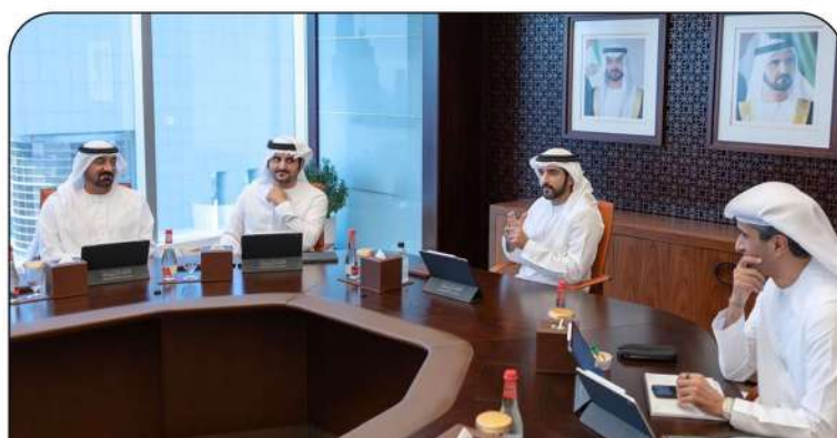
Dubai Approves Transformative Initiatives; Agricultural Incentives and Single-Use Plastics Ban