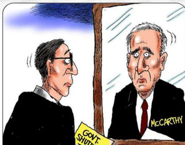
UN Security Council is trying for a fifth time to adopt a resolution on the Israel-Hamas war